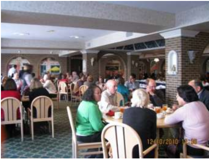
Attendees enjoying a great lunch above and below listening intently to one of the many exciting speakers