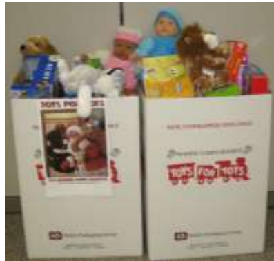
"Toys for Tot" DoDIG drop box