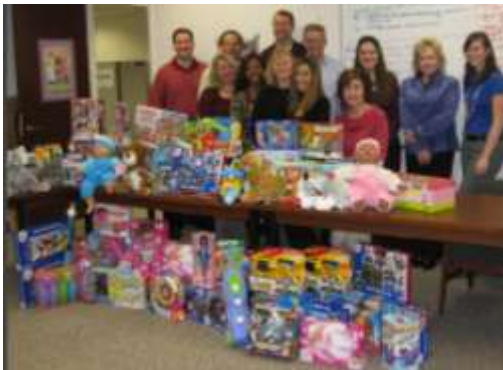
Toys collected by DoD IG, Yorktown personnel