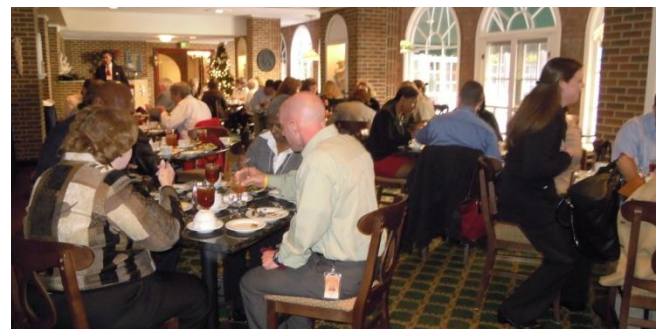
(Above) Attendees enjoy a great lunch sponsored by The Graduate School and Kearney & Company