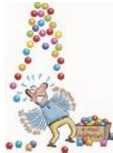
AGA's Chapter Recognition Program

Education and Professional Development. Chapters are rewarded for providing quality education and fostering professional development to enable members to achieve greater heights in their employment and meet certification requirements.